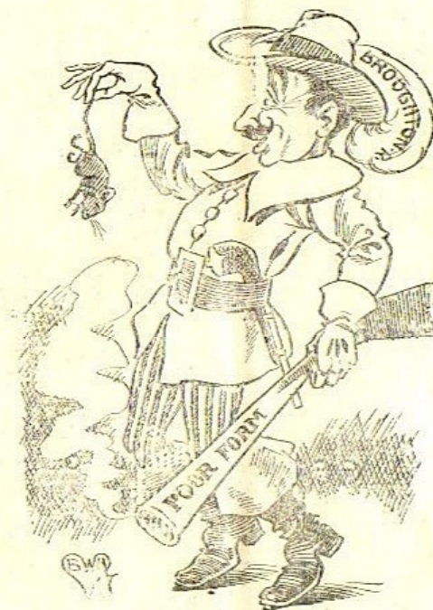
Broughton Rangers "big game."

The Rangers have scored a try on their new ground but have not yet won a match.