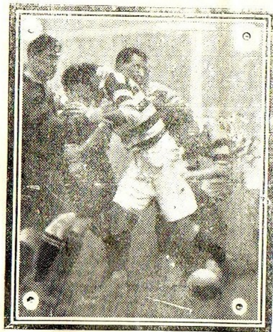
Rochdale forwards breaking away.