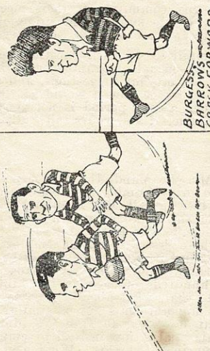
THE COMBINATION BETWEEN TRANTER AND ROBERTS, ENDED IN THE LATTER SCORING A FINE TRY