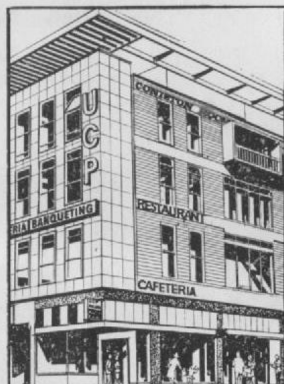
PALL MALL RESTAURANT MARKET STREET. Restaurant, Cafeteria, Banqueting