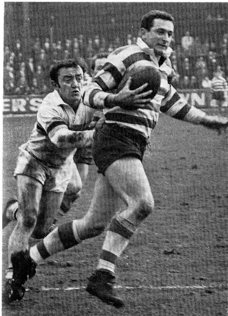
Winton in action