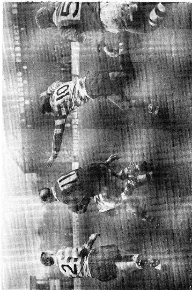
Salford's Sparks comes to a full stop as Nestor grabs him round the legs, while Sims and Bott move in