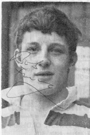
Meet the Players — No. 11