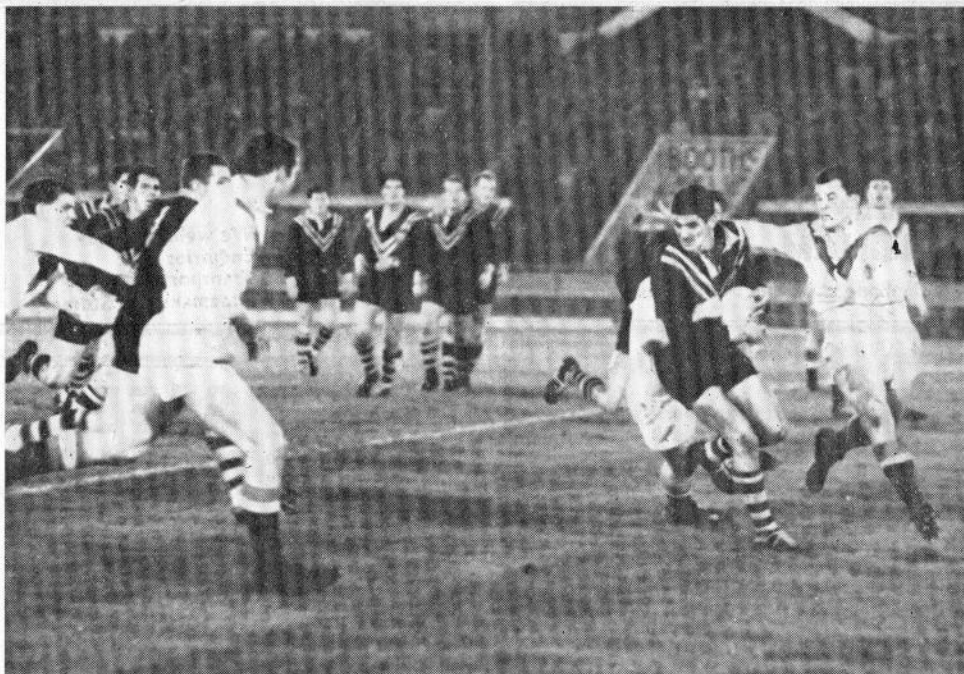
McDonald break foiled by Bishop and Mantle.