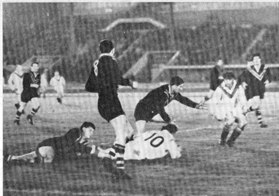
Watson's pass to Flanagan is knocked down.