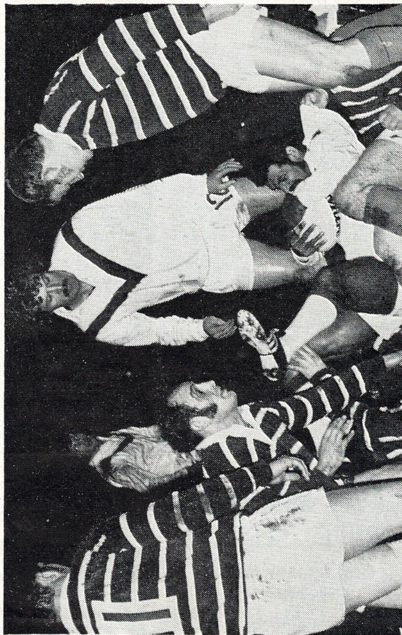
Action from the League Championship match against Featherstone — 27th October, 1972