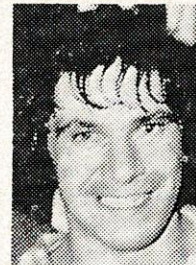
"Ray The Boot" —well on target

At Wilderspool Stadium in the third-round tie of the Challenge Cup trail The Chemics met their old rivals The Wire in a repeat of last season's final. Never a classic, but then few cup-ties produce the brand of rugby that graced Wembley Stadium last May. This was typical, no-nonsense rugby with the close result flattering Warrington, who hardly