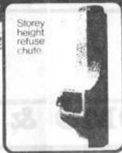
Storey height refuse chute.