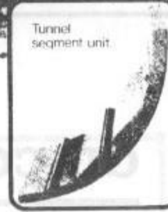
Tunnel segment unit.