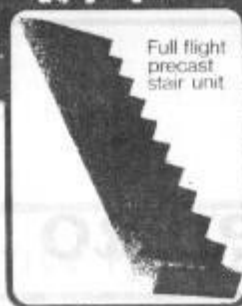
Full flight precast stair unit