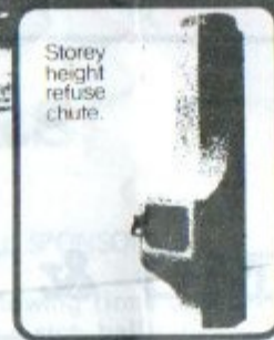
Storey height refuse chute