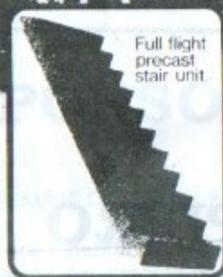
Full flight precast stair unit