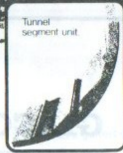
Tunnel segment unit