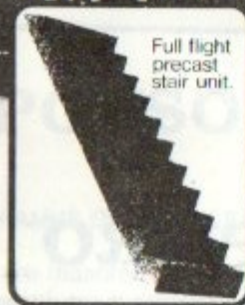
Full flight precast stair unit.