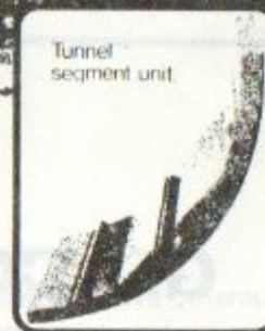
Tunnel segment unit.