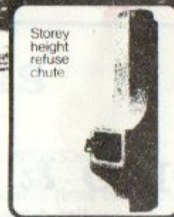
Storey height refuse chute.