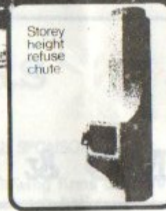
Storey height refuse chute.