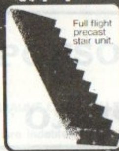
Full flight precast stair unit.