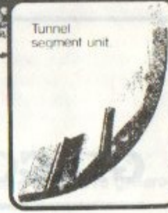
Tunnel segment unit.