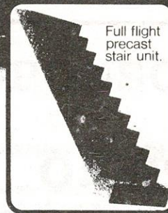
Full flight precast stair unit.