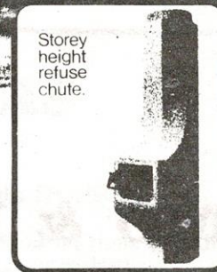
Storey height refuse chute.