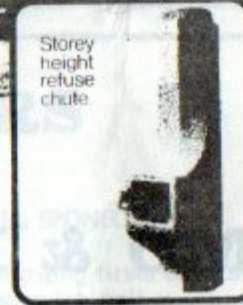
Storey height refuse chute.