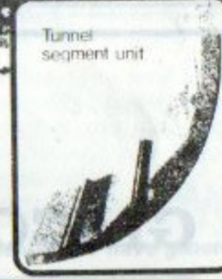
Tunnel segment unit.