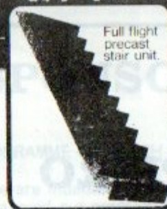
Full flight precast stair unit.