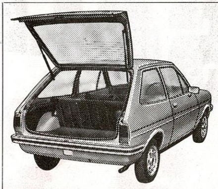
FORD FIESTA L