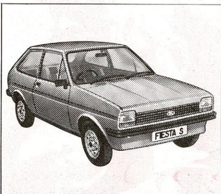
FORD FIESTA S