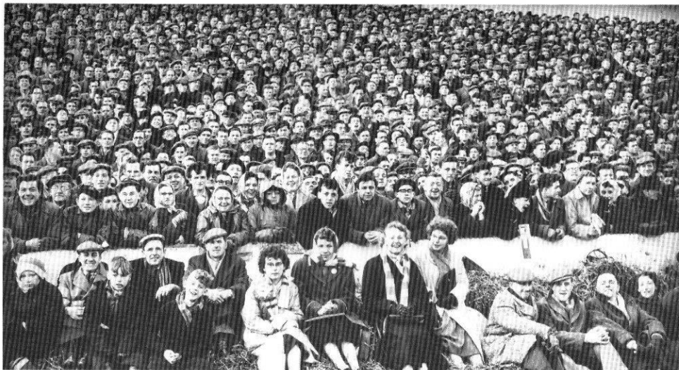
1. No safety problems here, Oldham v Wigan at Watersheddings in 1958. What a lovely crowd!

A regular feature in which we delve into the photographic files of the Oldham Evening Chronicle. This week: Golden Oldies!