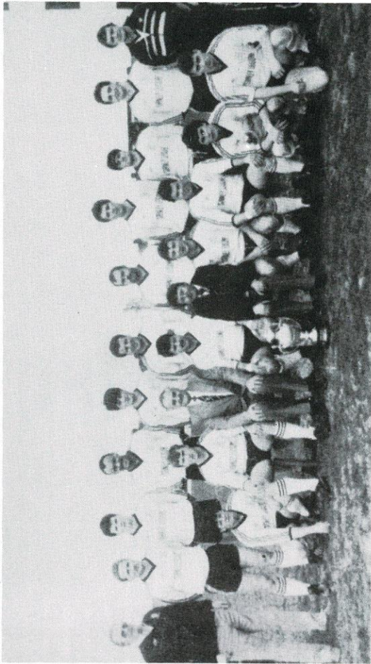
WIDNES 'A' TEAM 1984-85