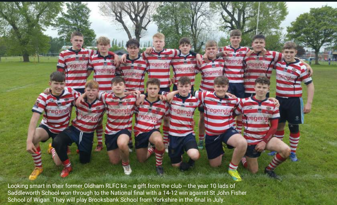
Looking smart in their former Oldham RLFC kit – a gift from the club – the year 10 lads of Saddleworth School won through to the National final with a 14-12 win against St John Fisher School of Wigan. They will play Brooksbank School from Yorkshire in the final in July.