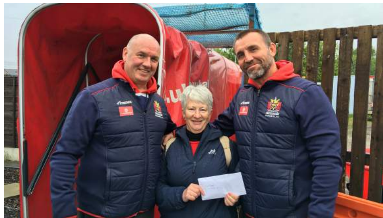
ORSA treat for players

"Funds go directly on players and I would urge fans and supporters to get involved and donate whatever they can; no amount is too small."