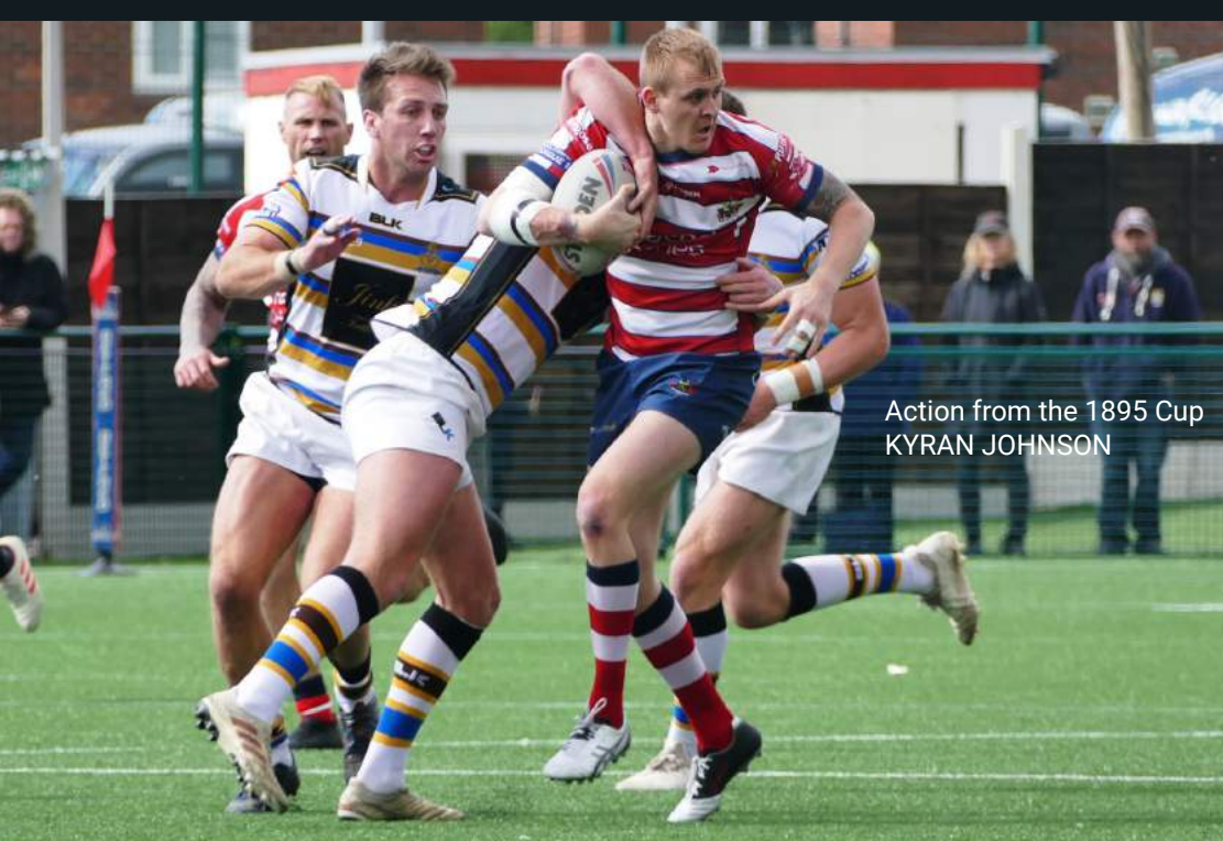
Action from the 1895 Cup KYRAN JOHNSON