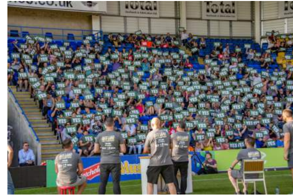
Wow! Look at that crowd. State of Mind broke a world record when addressing this crowd in the summer of 2018.