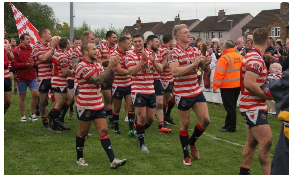
TOP: The 1911 Champions after their win in the final against Wigan.